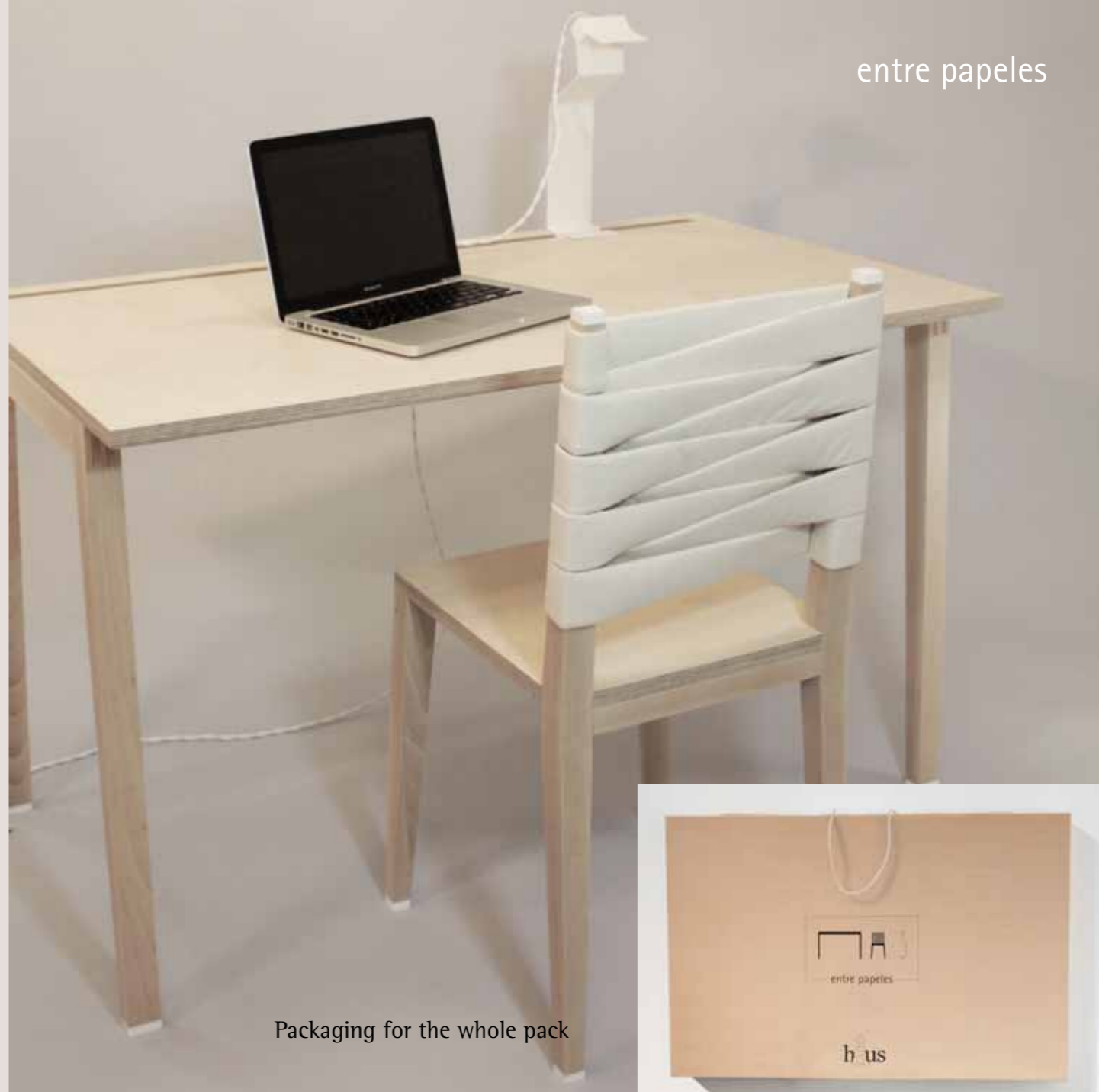
Packaging for the whole pack